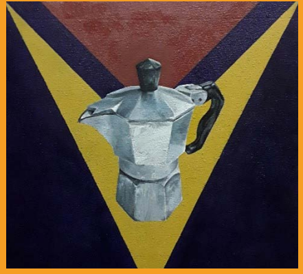
Standard Collective image © Andy Smith. From the Solid Air Series, 2023