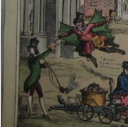
A flying postman is collecting a letter from a footman in livery, who is smoking a giant pipe.

William Heath imagined wondrous things that might happen in the future, just like we do today!