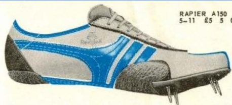
RAPIER A150 5-11 £5 5 0

This super lightweight shoe has every feature the top athlete can ask for.