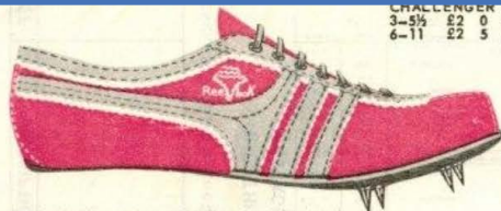
CHALLENGER A100 3-5½ £2 0 3 6-11 £2 5 0

An inexpensive shoe suitable for competition and training. Full chrome upper, translucent rubber sole fitted with four screw-in-spikes and foam rubber tongue and sock linings.