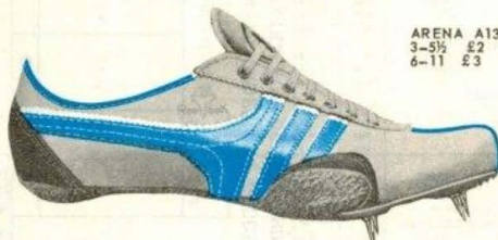
ARENA A130 3-5½ £2 16 6 6-11 £3 3 0

An inexpensive shoe suitable for competition and training. Full chrome upper, translucent rubber sole fitted with four screw-in-spikes and foam rubber tongue and sock linings.