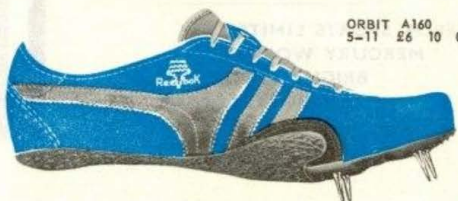
ORBIT A160 5-11 £6 10 0

The top shoe in the Reebok range of track shoes.