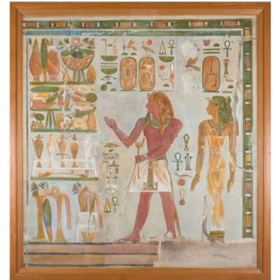
Deir el-Bahari Temple Scene by Howard Carter.

With spectacular coloured wall scenes adorning the temples and tombs throughout Egypt, this study day focuses on ancient Egyptian art, those who created it and those who copied it. The sessions will look at how and why such scenes were produced, deciphering key images, texts and the materials used, both in ancient times and by archaeological artists such as Howard Carter, whose huge watercolour copied from the Deir el-Bahari funerary temple of Hatshepsut is currently in Bolton on loan from the Egypt Exploration Society.